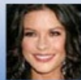
Catherine Zeta Jones