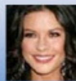
Catherine Zeta Jones